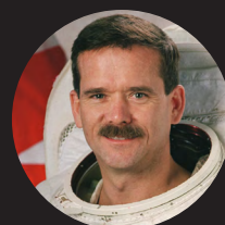
Chris Hadfield Astronaut