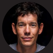
Alex Honnold Pro Mountain Climber